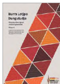
Burra Lotjpa Dunguludja - Aboriginal Justice Agreement - Phase 4 is a long-term partnership between the government and Aboriginal communities to work together to improve Aboriginal justice outcomes, family and community safety and reduce over representation in the Victorian criminal justice system.