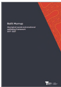
Balit Murrup: The Aboriginal Social and Emotional Wellbeing Framework 2017-2027 - will improve the social and emotional wellbeing of Victorian Aboriginal people by reducing the incidence, severity and duration of mental illness, reducing suicide rates, and preventing and lessening the devastating impacts of family violence and alcohol and drug abuse.