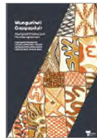
Wungurilwil Gagapduir Aboriginal Children and Families Agreement 2018 - commits to better outcomes for Aboriginal children and young people by building their connection to Culture, Country and community.