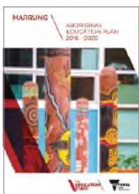
Marrung: Aboriginal Education Plan 2016-2026 - ensuring Aboriginal people, at every stage of their learning and development journey, achieve their potential, succeed in life, and feel strong in their Cultural identity.