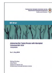
Advancing the Treaty process with Aboriginal Victorians - The Victorian Government is committed to establishing a treaty process as part of government's broader commitment to self-determination. This work is about creating a new relationship between government and the Aboriginal community to achieve long-term generational change and improved outcomes.