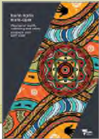
Korin Korin Balit-Djak: Aboriginal Health, Wellbeing and Safety Strategic Plan 2017-2027 - strives to realise the Victorian Government's vision for self-determining, healthy and safe Aboriginal people and communities.