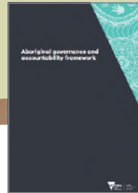
Aboriginal Governance and Accountability Framework 2017-2027 - provides a forum for building stronger relationships between Aboriginal communities and the department and will involve Aboriginal communities in policy development and decision making, including resource allocation.